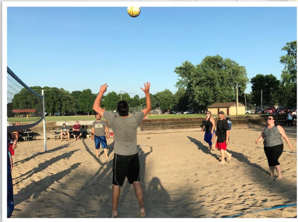
Adult Volleyball League