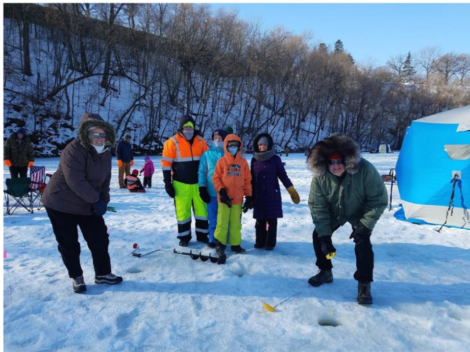
Ice Fishing Adventures