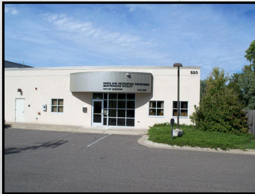
Joint Maintenance Facility