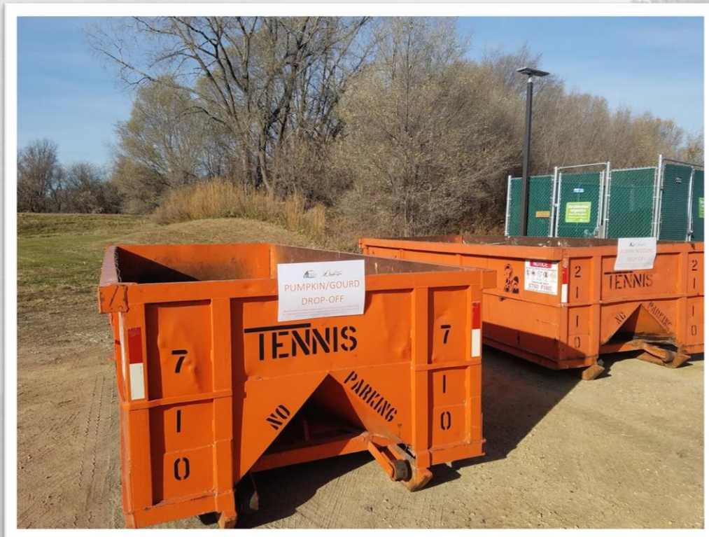
Pumpkin Drop Off