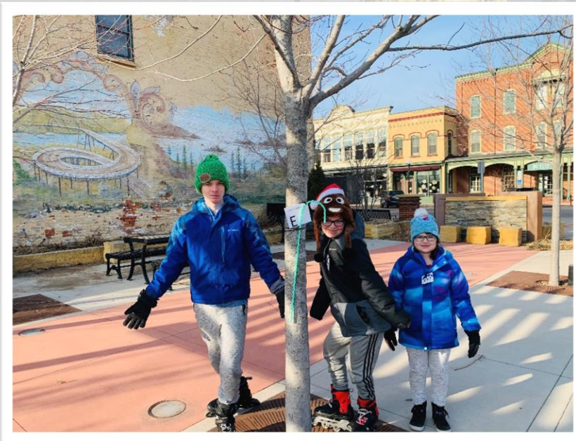
Candy Cane Hunt