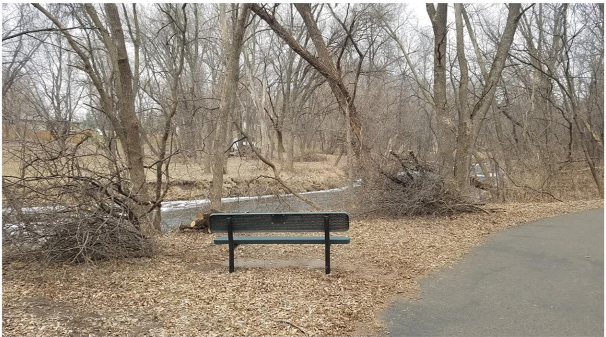
Removal of Buckthorn and other exotic species near Vermillion River from Bauer Trail