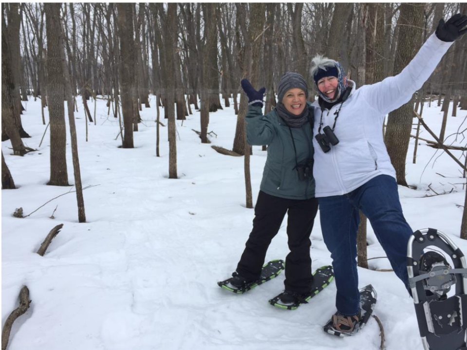
Snowshoe Guided Hike