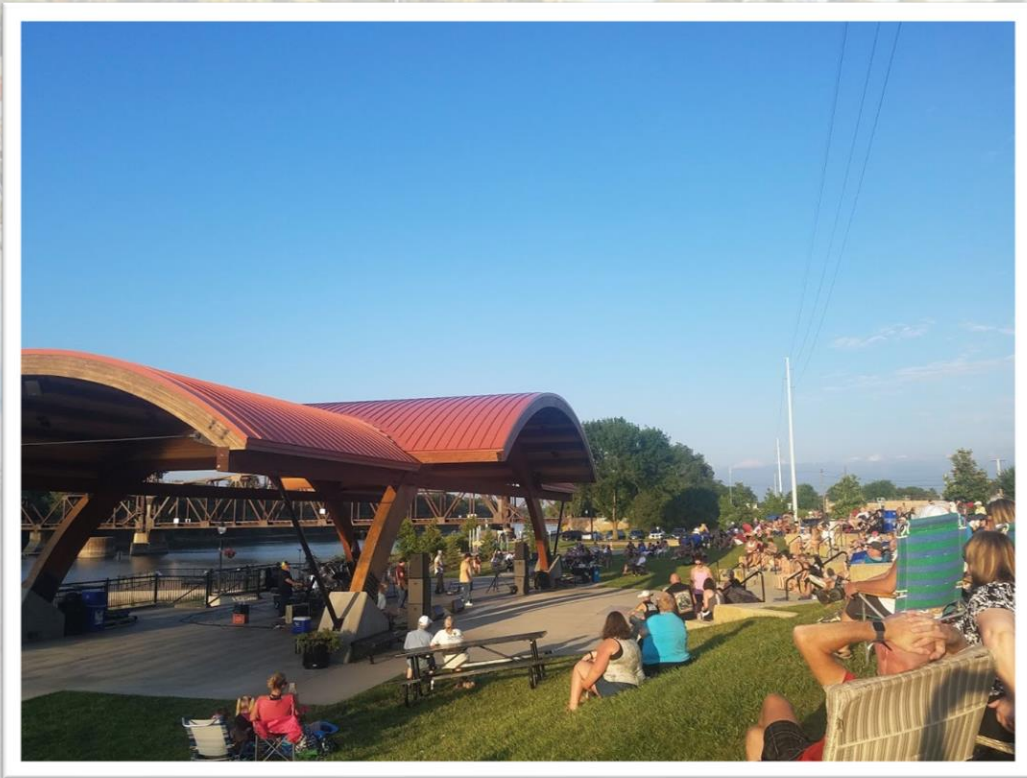
Music in the Park