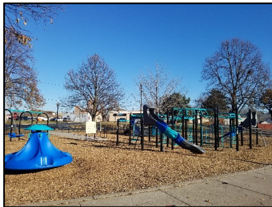
Wilson Park Playground