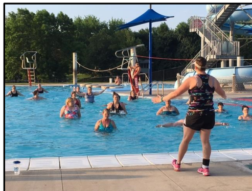
Water Fitness Class