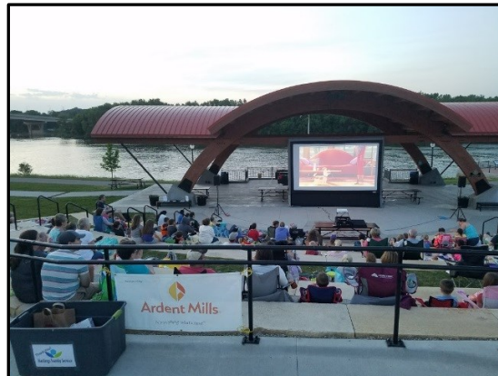
Movies in the Park