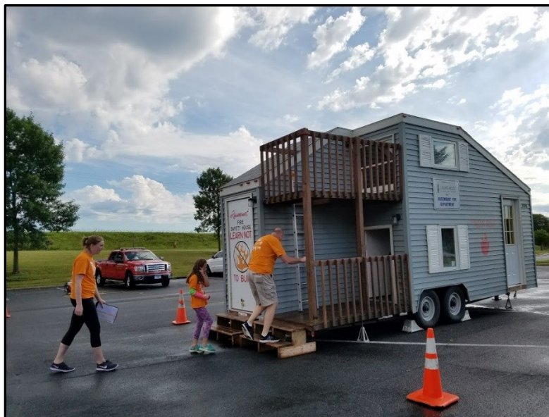
Safety Camp Activity