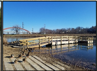
Lake Rebecca Fishing Pier