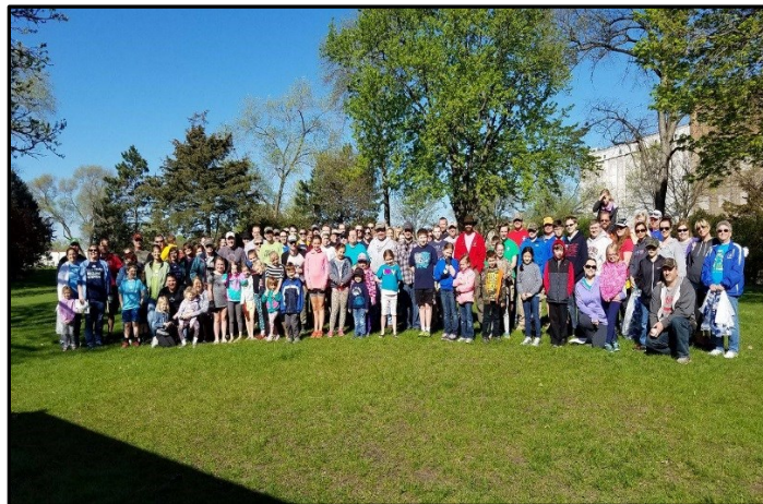
Annual Parks and Trails Clean Up