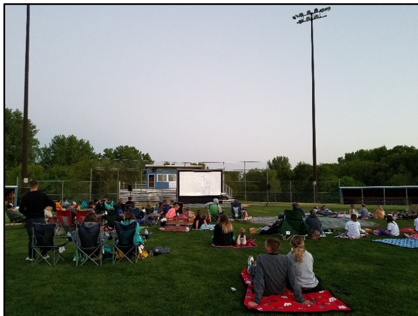
Movie on the Mound