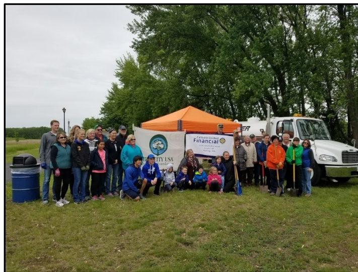
Arbor Day 2017