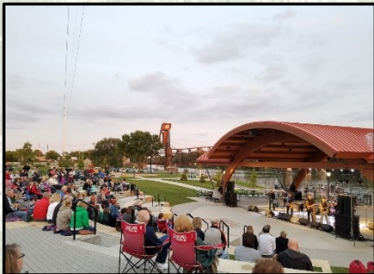
Music in the Park

City of Hastings Parks and Recreation Department