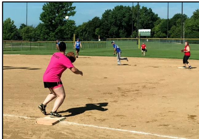
Adult Softball League