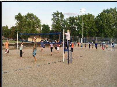
Adult Sand Volleyball