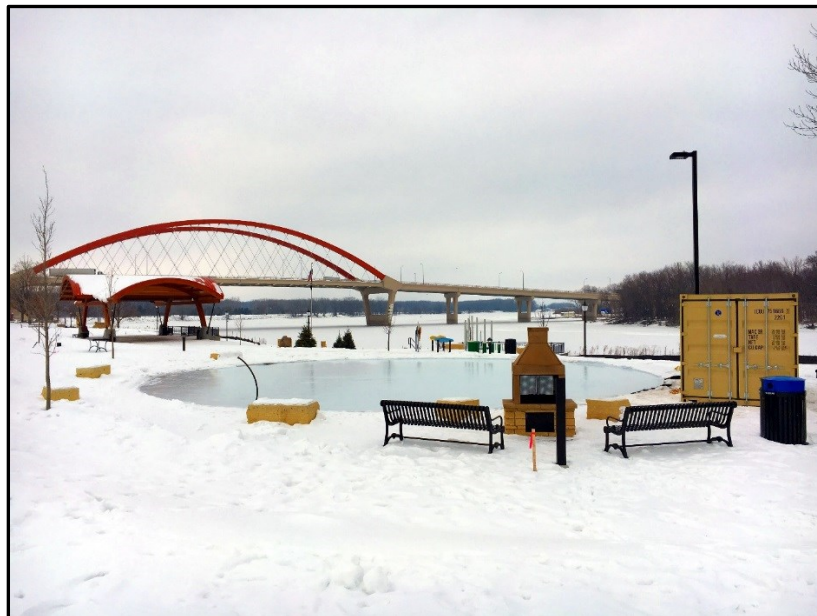
Levee Park Recreational Rink