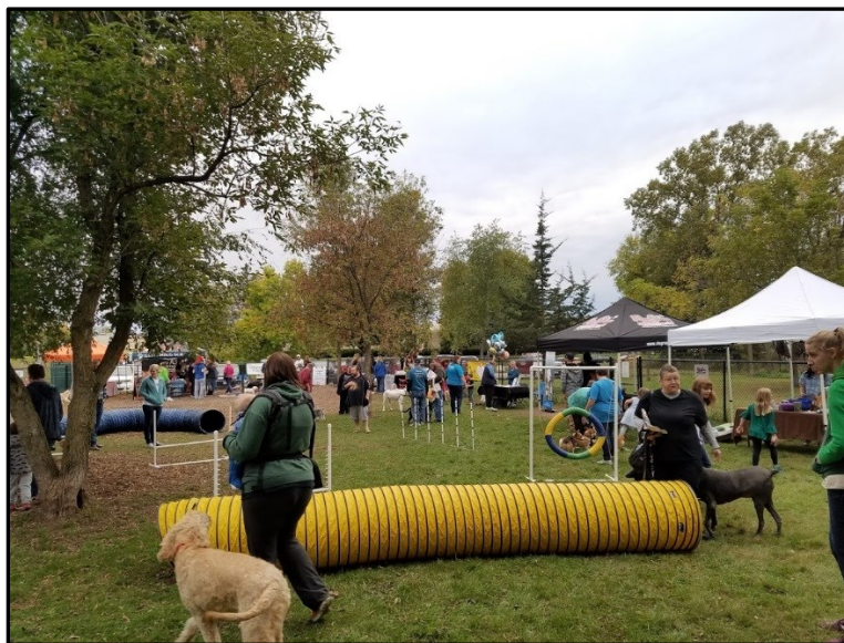
Paws in the Park