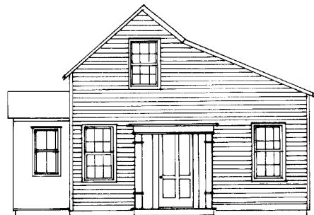
Some small vernacular houses date from the 1850s and 1860s.