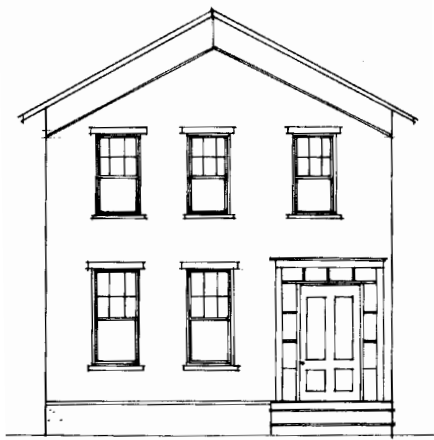
A low-pitched gable roof, brick or clapboard exterior, and an entry framed by a transom and sidelights are typical features of Greek Revival houses.