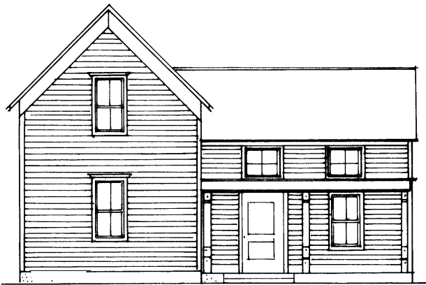
The L-plan was a popular vernacular house type in Hastings. The exterior trim ranged from simple to elaborate, but an open porch along the wing was a standard feature.