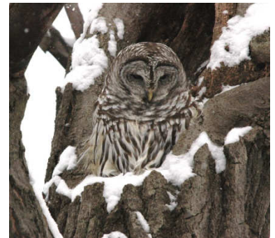
Barred Owl

On your way back through downtown Hastings you can find plenty of places for refreshments. Maybe stop off for ice cream, a piece of pie or a hamburger and your favorite beverage.