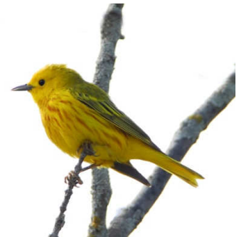
Yellow Warbler