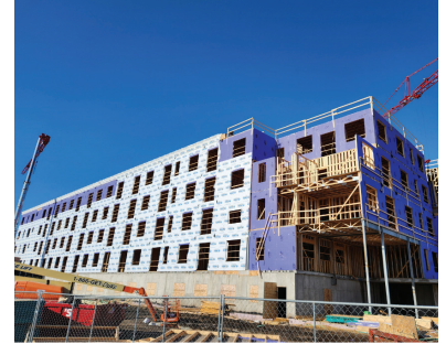
LAKE ISABELLE FLATS