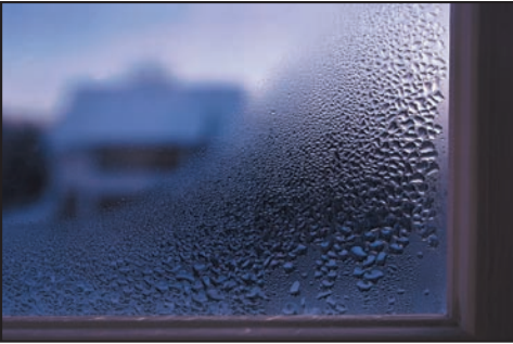
Condensation on the inside of a windowpane.