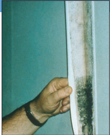
Mold growing on the back side of wallpaper.

Suspicion of hidden mold You may suspect hidden mold if a building smells moldy, but you cannot see the source, or if you know there has been water damage and residents are reporting health problems. Mold may be hidden in places such as the back side of dry wall, wallpaper, or paneling, the top side of ceiling tiles, the underside of carpets and pads, etc. Other possible locations of hidden mold include areas inside walls around pipes (with leaking or condensing pipes), the surface of walls behind furniture (where condensation forms), inside ductwork, and in roof materials above ceiling tiles (due to roof leaks or insufficient insulation).