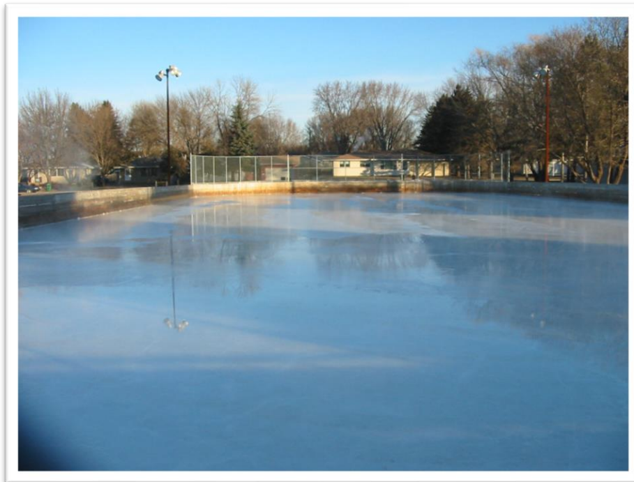
Lions Hockey Rink