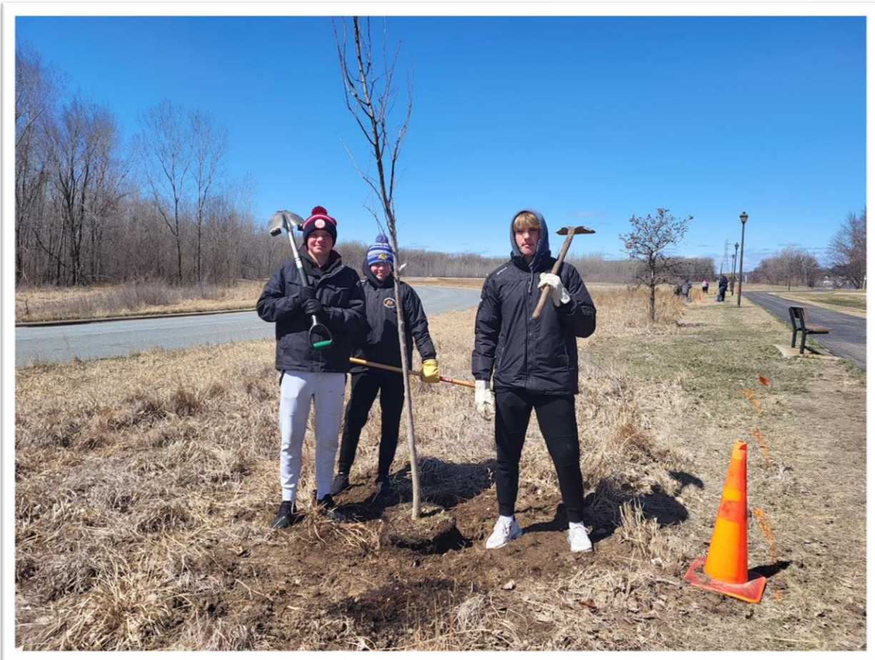
Arbor Day Volunteers