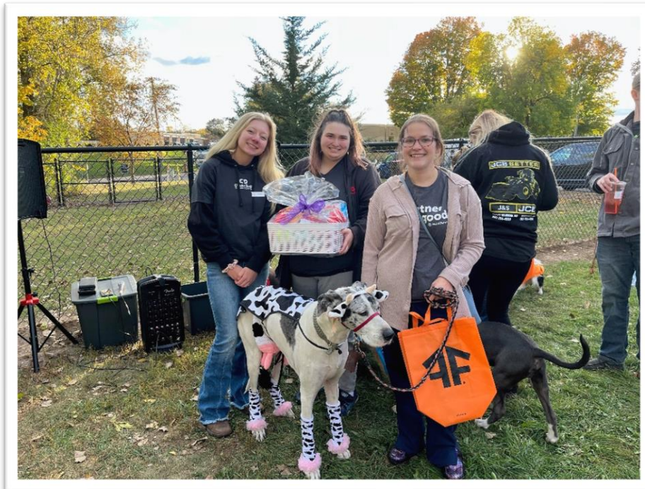
Paws in the Park