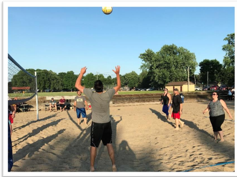
Adult Volleyball League