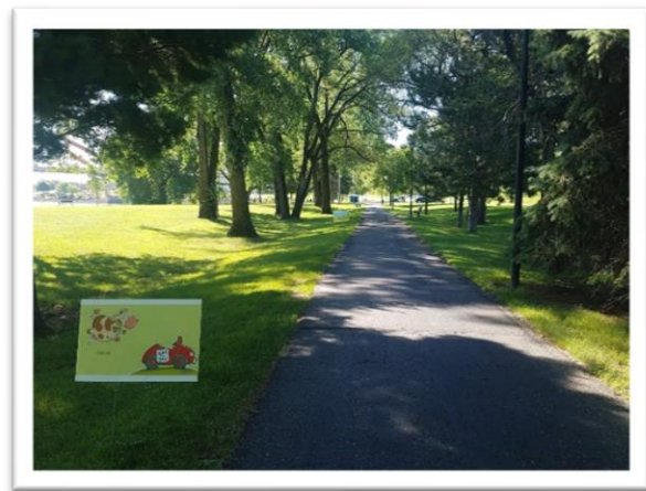
Earth Day StoryTrail