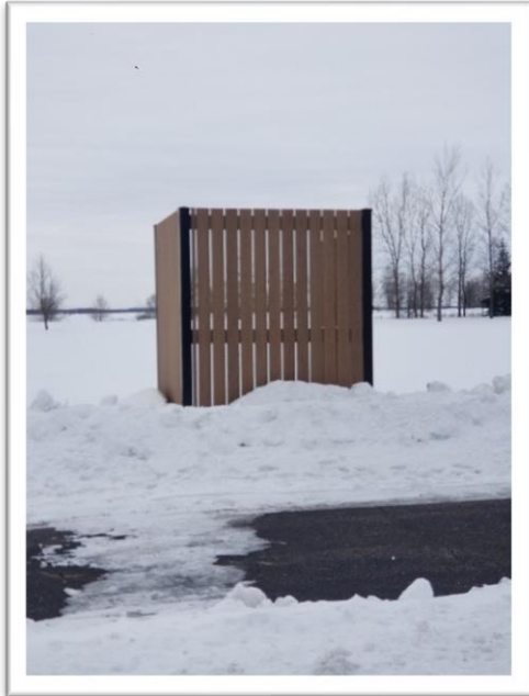
Portable Bathroom enclosures