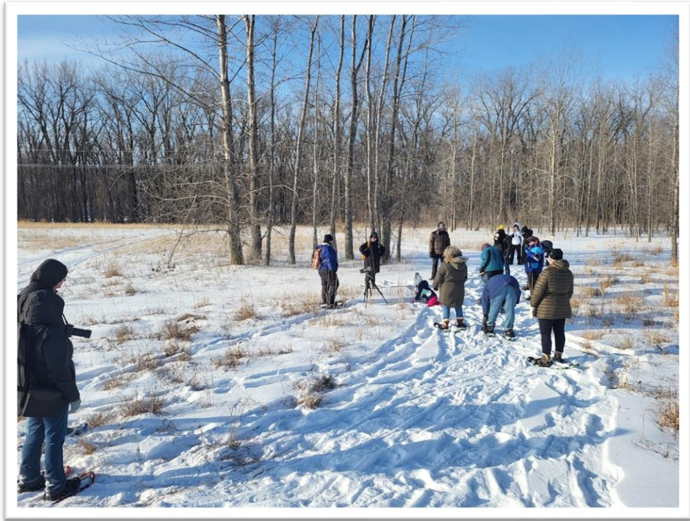
Snowshoe Guided Hikes