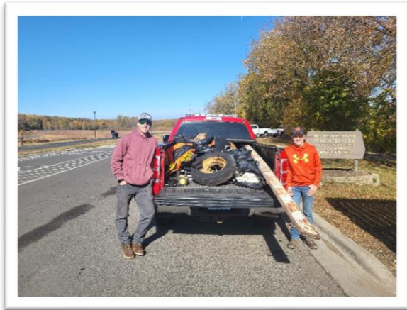
Parks and Trails Clean Up