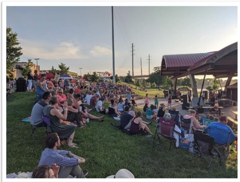
Music in the Park