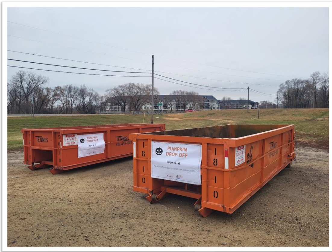
Pumpkin Drop off