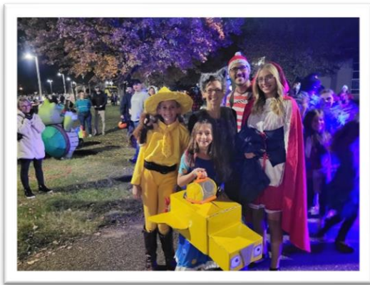
Community Halloween Party