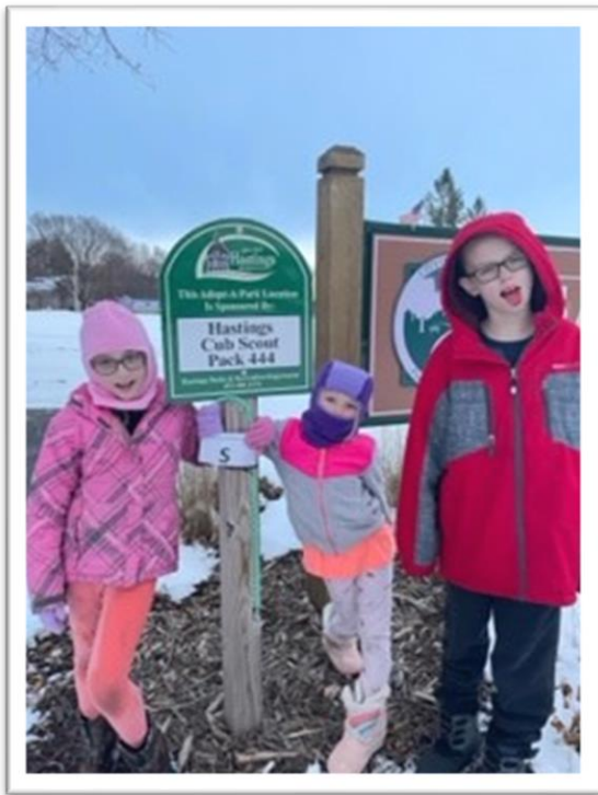
Candy Cane Hunt