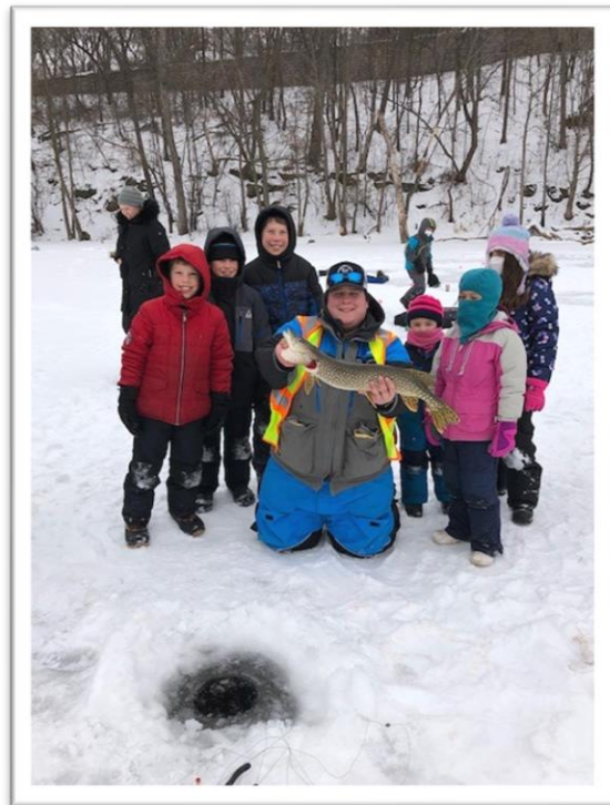
Ice Fishing Adventures